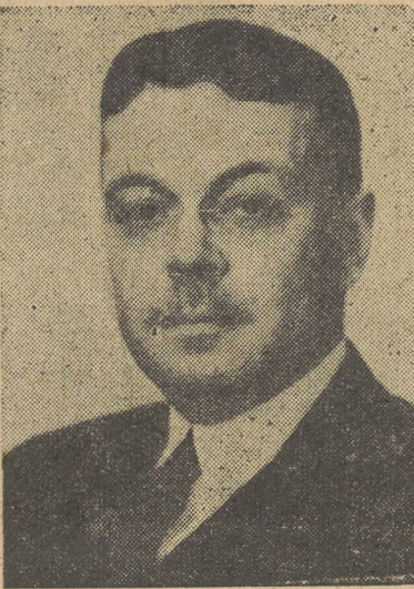
RIGHT: Attorney General, William A. Schnader, victorious candidate for the Republican nomination for Governor. He will be opposed this fall by Joseph F. Guffey, Roosevelt Democrat.