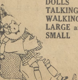
DOLLS TALKING, WALKING, LARGE and SMALL