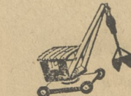
34 INCHES LONG ALL STEEL A REAL TOY