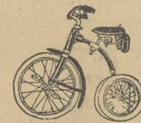
ALL METAL RUBBER TIRES All Sizes