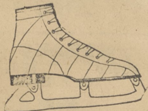
JOHNSON'S LIGHTNING FAST AND STURDY

A DISPLAY OF TOYS EQUAL TO THE CITY STORES RIGHT AT YOUR DOOR. THIS YEAR YOU WON'T HAVE TO HUSTLE AND BUSTLE! JUST DROP IN AND LET THE KIDDIES PICK OUT WHAT THEY WANT SANTA CLAUS TO BRING THEM. BUT—YOU BETTER COME EARLY.