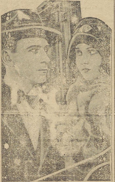
"He took me home."

"Well, Dr. Davis, so this is how you spend your time in the office!" May was the first to recover her voice. "No, don't you dare try to talk to me!" She put up a warning hand as Davis opened his mouth to speak. "And don't stand in front of that—that shameless woman and try to hide her. I know who it is. I saw her." "Why—why, May, I was just—" "I've had enough of your explanations for one day," May retorted. "It wasn't enough that you took her to lunch, but she had to come back here this afternoon. Well, I'm glad I've found out the worst. Now I know exactly what to do, and what's more, I have witnesses." "I must say, Dr. Davis, that I think your conduct is rather—ah—uh—" "You keep out of this!" Davis snapped, starting belligerently to-