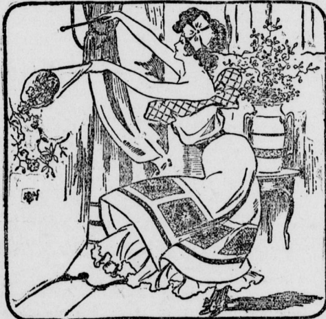
Can you find two rabbits that she has caused to disappear?

hauled on the line until we succeeded in worrying him nearly to the boat, when he rose to the surface and attacked us with open mouth. We repelled the attack with harpoon pole and rifle. The former was promptly bitten in three places, but the latter apparently finished him. It was so near dark that we decided to carry him in the skiff a mile down the river to where our sloop was anchored, and to skin him the next morning. We broke the seats out of the boat, and together managed to lift the head of the alligator aboard and tie it. We then tried the other end, when the reptile came to life and landed a blow with his tail which lifted me out of the skiff into the saw grass, with the breath knocked out of my body and hands and face badly cut by the grass. Boat and boatmen were capsized. As my rifle had fortunately been left upon the bank I was secured him by floating the again. We secured him by floating it out, boat under him and then bailing it out. The alligator completely filled the boat, so that my companion and I sat upon his back as we paddled down the river with gunwales unpleasantly near the water.