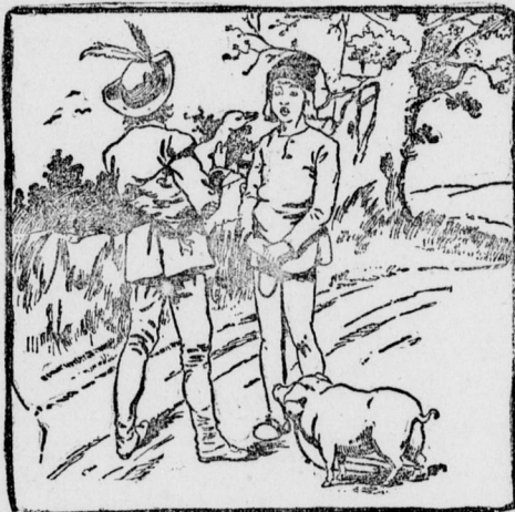
Find a goat and a horse.

to son. The dogs started after them and the mother bear began to run, but the little baby son couldn't run as fast as she did, and the dogs were gaining on him, so what do you suppose the mother bear did? Leave her little son behind? No, sir-ee, she picked the baby bear up on her stout nose and tossed him way ahead; then she ran fast and caught up to him and gave him another boost that sent him flying through the air. She kept this up for a mile and a half, then she was too tired to go any further and the dogs surrounded her. Then she sat up on her haunches, took her baby in her hind paws and fought the dogs off with her fore paws. And how she did roar!"