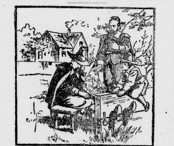
Find two officers who took part in the proceedings.

end of one of the feathers. It will always fall point first, like an arrow or spear, and stick in anything that is not harder than wood.