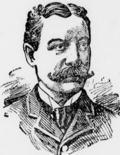
CHARLES T. YERKES.

Controls the London Underground. Mr. Charles T. Yerkes, who recently closed out his interests in the Chicago elevated railway system, is in the game again. This time his field of operations is on the other side of the Atlantic. A syndicate of capitalists, of