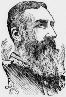
KING LEOPOLD OF BELGIUM.

King Leopold of Belgium has had made for himself a very handsome automobile. The carriage work, of the most elegant design, is of aluminum, finished in red, with the truck in blue. All the wood parts which are visible