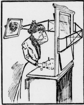
WHEN DRESSING THE HAIR.

The invention illustrated below has for its object to provide a supplemental mirror having an adjustable connection with the bureau and adapted to be set at a different angle to the large glass to aid in showing a rear view of the person dressing at the bureau. Of course it is a woman's invention, as it would take one of the gentler sex to appreciate the merits of such an arrangement. The invention is formed of a light framework of either metal or wood and is so arranged that the several parts will fold in small compass when not in use, the sections being hinged together