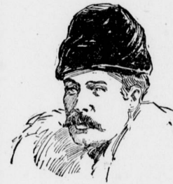
LIEUTENANT R. E. PEARY.