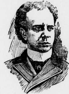
SIR WILFRID LAURIER.

Sir Wilfrid Laurier, the premier of Canada, whose ministry has been upheld by an overwhelming majority, is undoubtedly the most prominent figure in the Canadian world of politics. The recent election was most bitterly contested, and the Conservatives were defeated largely owing to their efforts to stir up racial and religious differences in the Dominion. Premier Laurier,