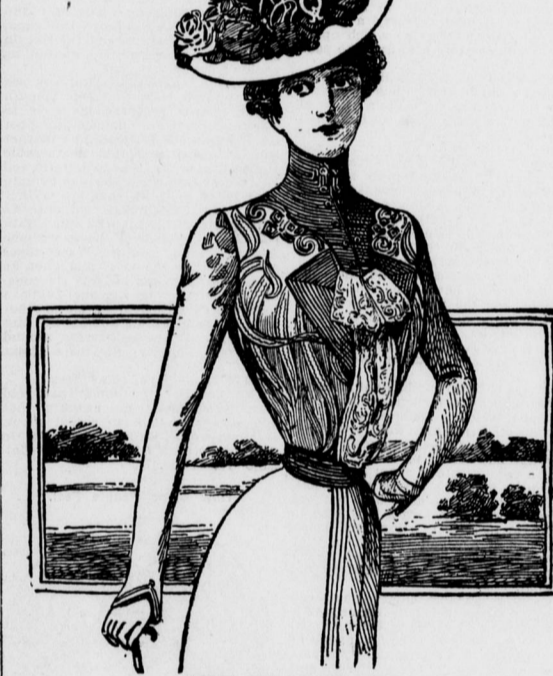
MODEL FOR A CLOTH GOWN.

struggle has been to arrive at a compromise between the article that would appear advantageously on the street and yet mark a decided departure from the hard quill and crown band habit of last season. A single plume from the old gray goose's tail, stuck independently through the crown of a plume felt, is not the approved idea now. A green, or gray, or brown felt with a bent-edge brim and a stiff "bowler" crown seems to be the triumphant one of many shapes and as might be expected it has been designated patriotically by the name of Admiral Dewey's flagship, the Olympia.