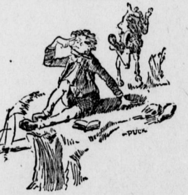
Post—"I do wish something that rhymes with 'boat' would strike me!"

In this enormous mass, politics, properly speaking, is represented by only 144 organs. Strange to say, its medicine that absorbs the largest quantity—namely, 206. Financial matters are dealt with in 195 publications, fashions in 113, law in 95, agriculture in 67, and industrial matters in 54. There are 26 journals on gas and electricity, 24 on assurance, 10 on cookery, 5 on matrimonial matters, and 25 on photography. The "Revue" reach the number of 162.