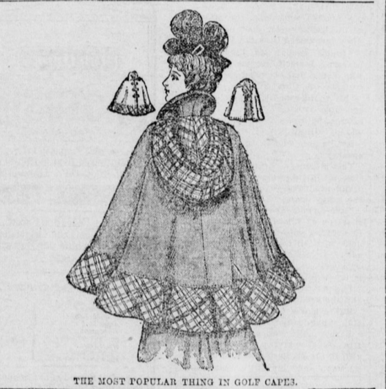
THE MOST POPULAR THING IN GOLF CAPES.

on and off with ease. The novel cape shown in the accompanying small illustration serves every need, while at the same time it is chic in the extreme, representing as it does the latest Parisian style. The model is in satin-faced cloth in soft mode, with yokes and bands of applique edged with velvet ribbon, but bangles and all heavy silks, as well as lace, are equally appropriate. The foundation is circular and extends to the edge of the third ruffle. The yoke is faced on, and the two upper ruffles are stitched into place as indicated, but the third and last is seamed to the edge. All three are circular.