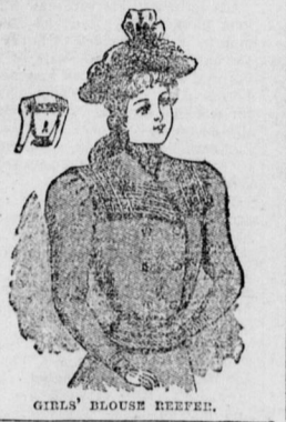
GIRLS' BLOUSE REEFER.