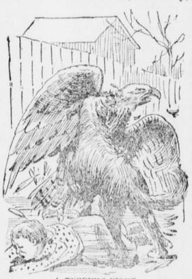
A TERRIFIC FIGHT.