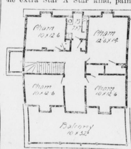
PLAN OF SECOND FLOOR

two coats yellow ochre. The chimneys are to be of yellow-pressed briek capped with smooth sandstones. All floors, including veranda and porch, will be double, with tar paper between them. No finished floor is to be laid until all plastering is done. All doors will have five panels running across the doors. All glass is to be American double thick. All windows will be hung with weights and pulleys. The owner will furnish art glass, shelf hardware, mantels and bathroor fixtures. George A. W. Kintz.