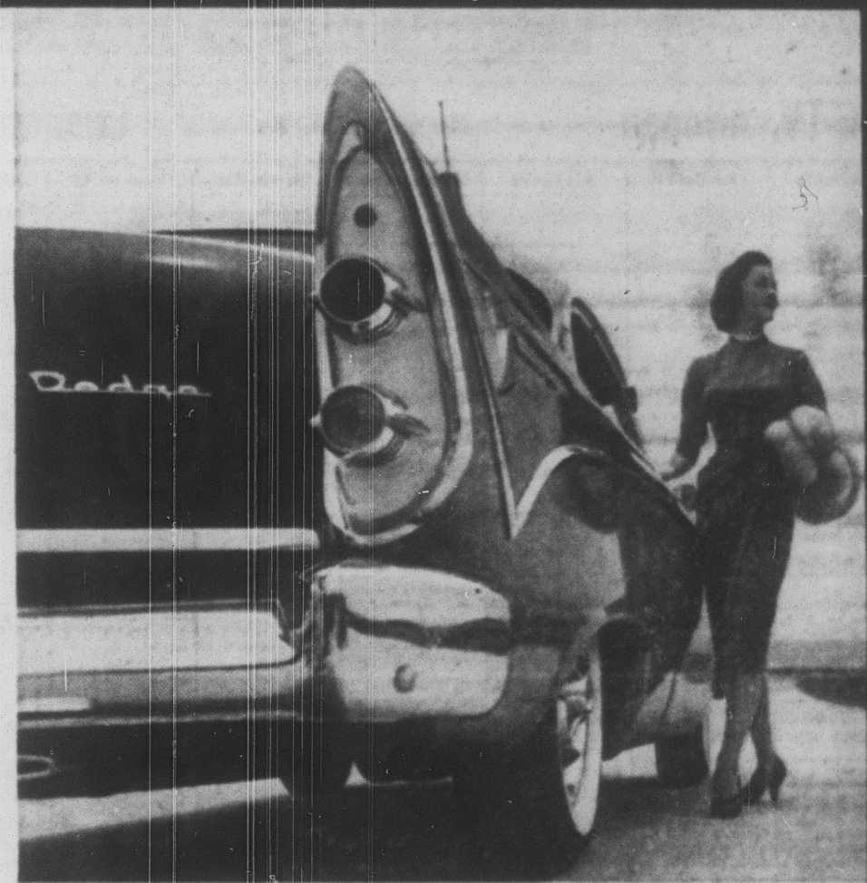
Born of Success to Challenge the Future! The Dramatic New '56 Dodge

New '56 DODGE Everything about it says SUCCESS!