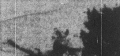
Dave Kielbowick, Patton-Chest Panther fullback (No. 75), is shown as he gains three yards on an off-tackle plunge midway in second quarter of play Saturday at Purchase Line field near Commodore. Four unidentified Purchase Line players are seen on the photo, with Bill Zumovitch (No. 64), Panther end, in background. The two teams fought to a scoreless tie in the sweltering contest.