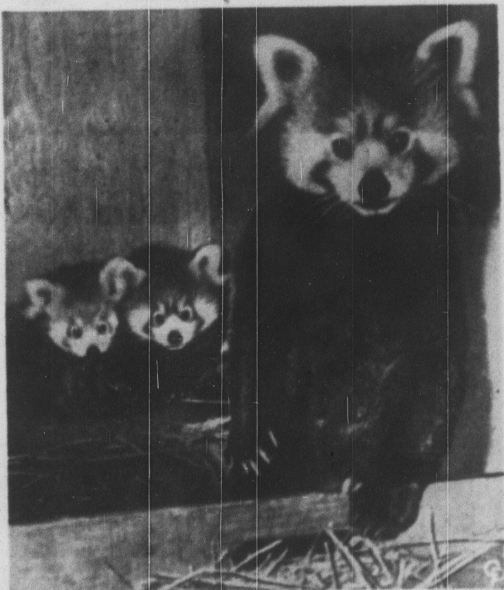
TWIN PANDAS, two months old, are shown with their mother at the Fleischacker Zoo in San Francisco. The mother seems to be giving the photographer a "stop, where you are" stare.