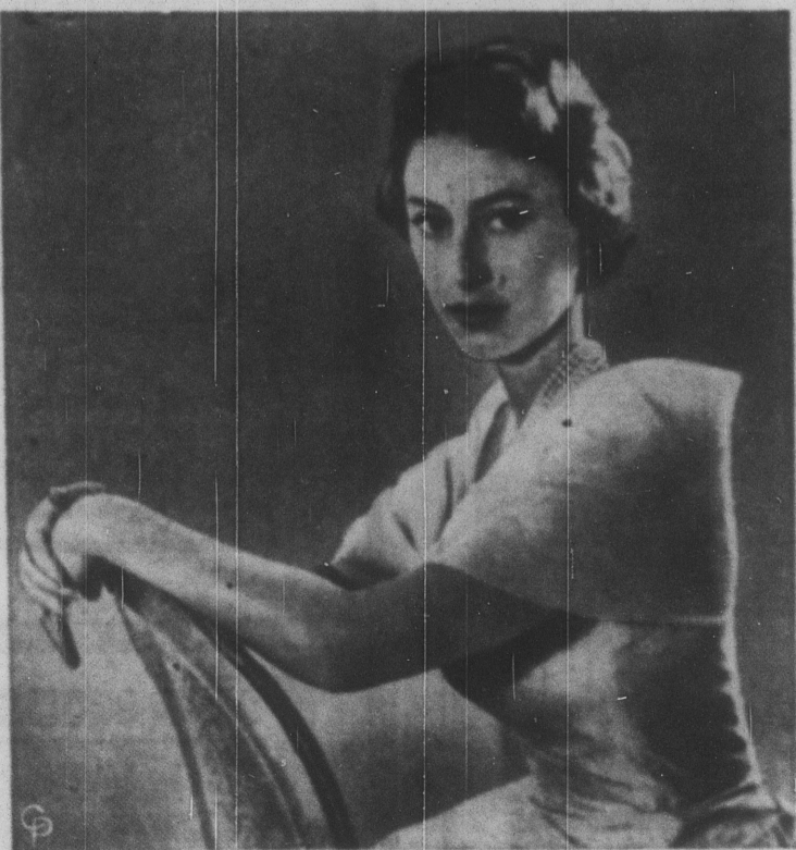
PRINCESS MARGARET of Great Britain poses in Clarence Home, her London home, for this 25th birthday portrait. In royal circles, a princess "comes of age" when she is 25, a circumstance certain to cause much speculation concerning her future romantic decisions.

DO BUSINESS where BUSINESS IS BEING DONE!