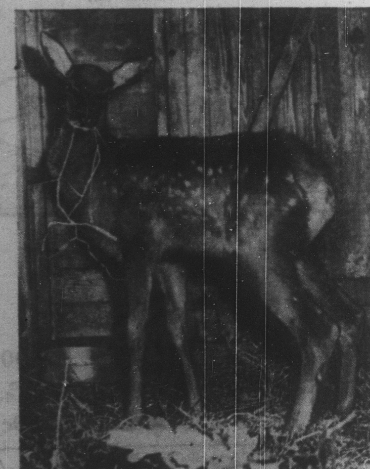
THE FIRST OF ITS BREED to see New York, a 65-pound Roosevelt elk calf is shown in its Bronx Zoo pen after arrival from California. A female, born last Spring, it was captured in the Madison Grant Forest in Humboldt County. The species is the most massive of all elk in this country and grows rapidly to maturity.