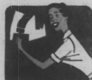
C. P. WELTY CO. Phone ORange 5-2331 FIFTH AVE., PATTON

The paint colors you've dreamed about come to life in the Dutch Boy Color Gallery - over 100 of the smartest decorator tones, plus suggested combinations and accents. Pick your own favorites in rich, handsome Dutch Boy Enamels, flat or gloss. It's so easy. why put it off any longer? You can have bright new rooms for old when you do your color scheming at the Dutch Boy Color Gallery.