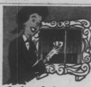
Color Scheme the modern easy way-

cal unit, thus speeding up any kind of operation. Other area companies having radio equipment are Ebensburg light for the event from scouts. Other speeding up any scoutmaster, who will be in charge on mixing of fertilizer. Other area companies having plans for the event from scouts.