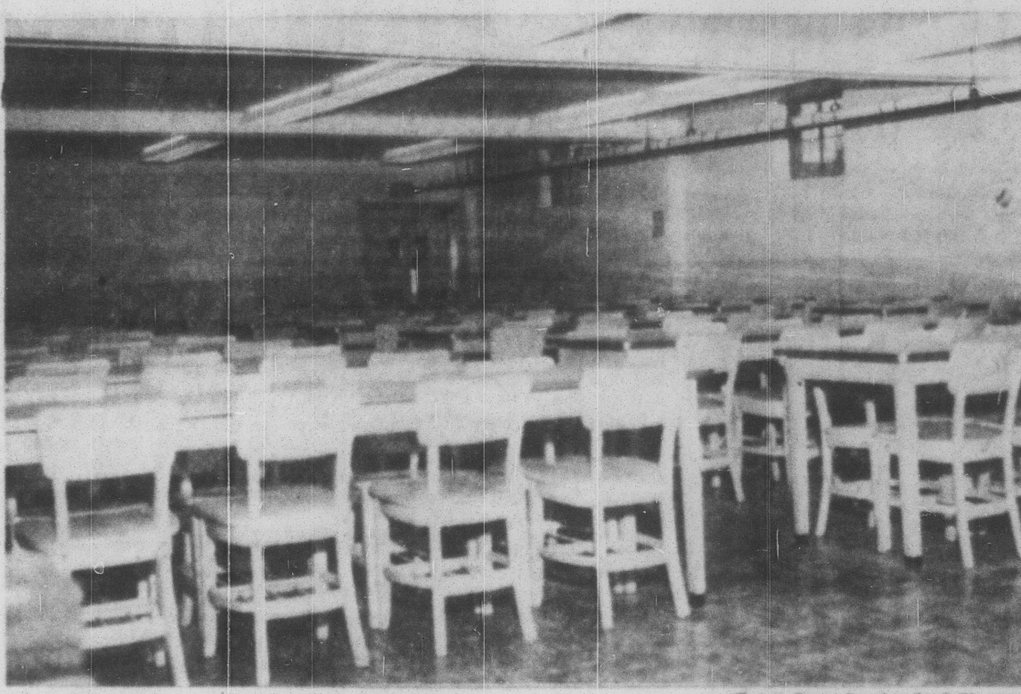
Here's an over-all view of the huge dining room in the cafeteria of the Hastings Memorial Building. Equipped to seat 200, the cafeteria, kitchen and a store room occupy almost half of the basement.