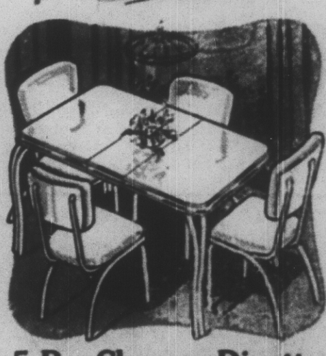
5-Pc. Chrome Dinette

PLENTY OF TIME TO PAY ON OUR EASY CREDIT TERMS