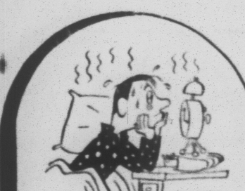
Can't Sleep These Hot Nights?