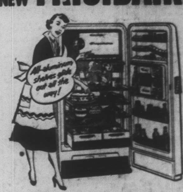
More for your money than ever before!

More for your money than ever before! Keep food longer at lower temperatures. Special Trade-In . . . Monthly payments!