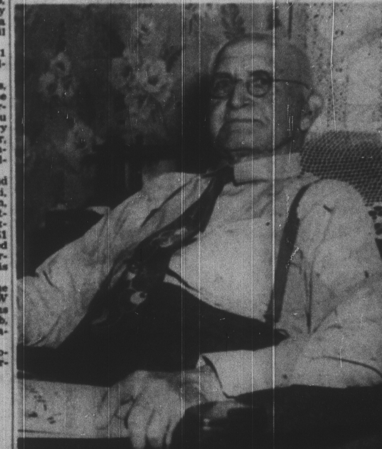
(James Studio Photo, Patton)