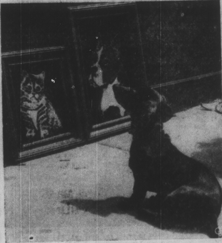
A FIVE-MONTHS-OLD DACHSHUND, "Sand," who is built pretty close to the ground, pauses during a stroll through Washington Square, New York City, to look at two exhibits in the outdoor art show.