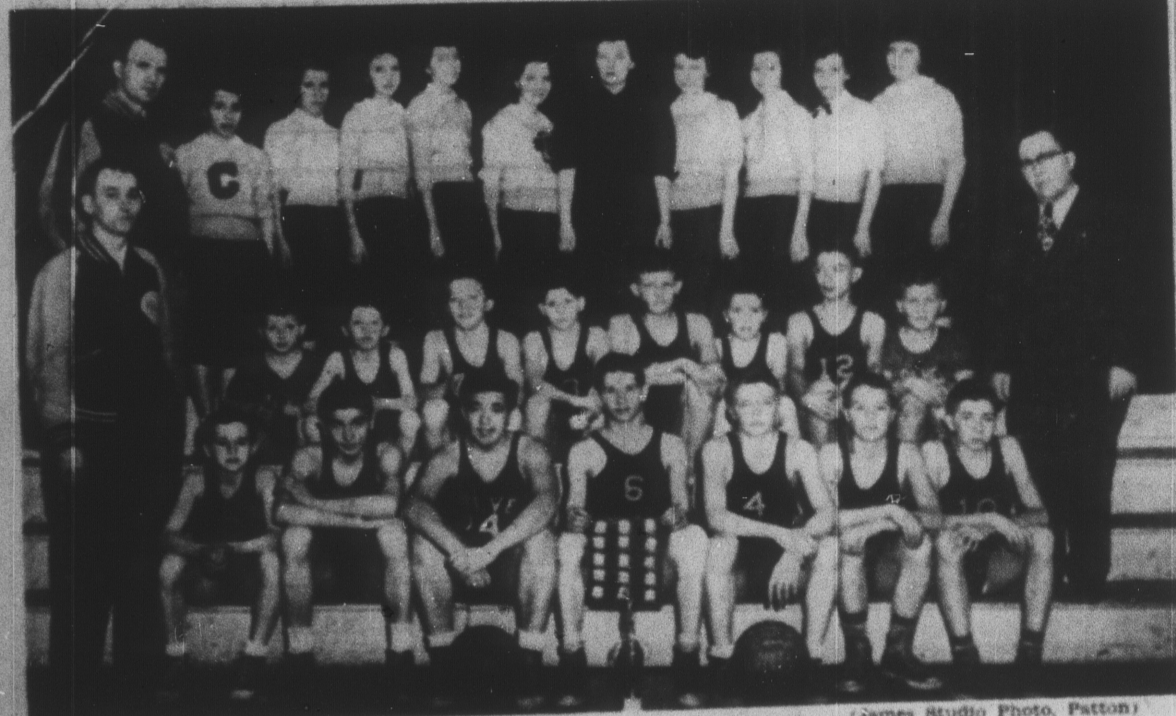
Pictured squad, coaches and cheerleaders of Colver Grade School Little Colts, winners for the second straight year of the county grade school basketball championship.