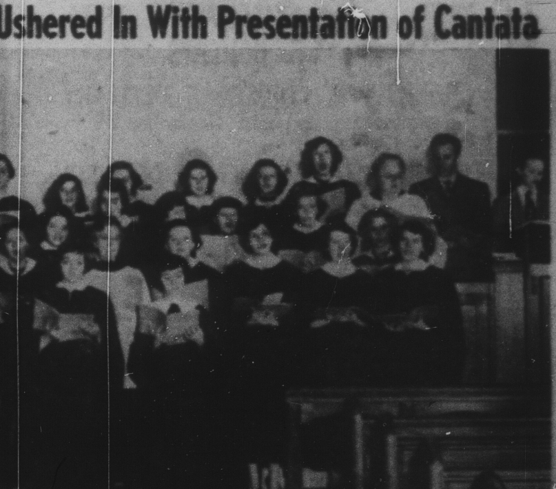
Pictured above are members of the combined choir of the Protestant churches of Patton on Wednesday evening presented one of the highlights of the 1951 Christmas Season Sunday evening—the Christmas Cantata, "The Manger of Bethlehem." Included in the group are members of the Methodist, Presbyterian, Lutheran, Baptist and Episcopal Churches. Despite bad weather, many persons witnessed the event.