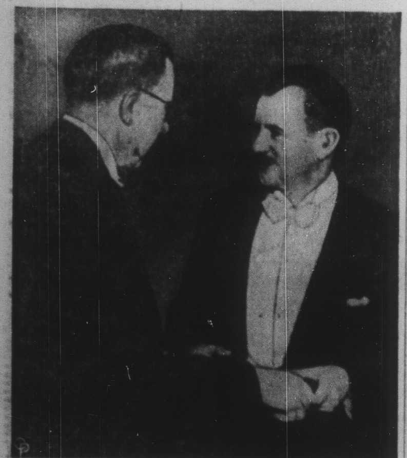
DURING A SPECIAL CEREMONY in Stockholm, King Gustav Adolf (left), of Sweden, presents the 1951 Nobel Prize in chemistry to Dr. Edwin M. McMillan. Award co-winner, Dr. McMillan, of the University of California, was one of three Americans honored.