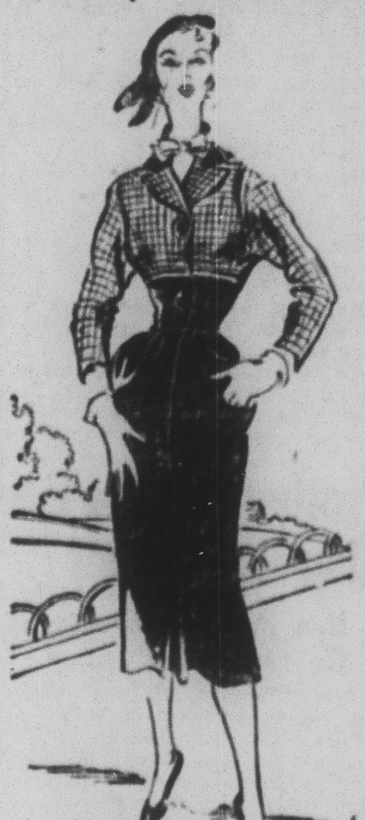
Check wool flock.