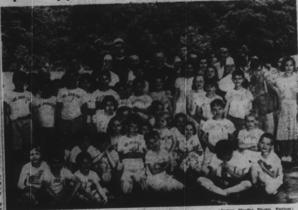
Orphans at St. John's and St. Mary's Orphanages at Cresson were honor guests at a picnic sponsored by Sons of Italy Lodge 319, Patton, at the Patton Recreation Park on Sunday.