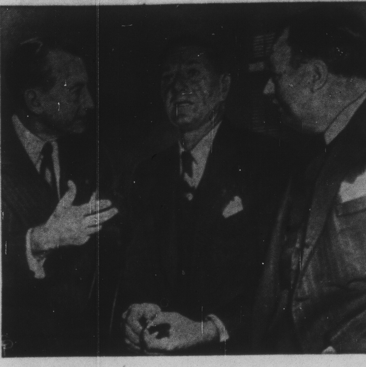
ADMINISTRATOR OF the Economic Stabilization Agency, Eric Johnston (left) and Michael Disalle (right), Director of the Office of Price Stabilization, confer in Washington with Sen. Burnet Maybank (J.-S. C.), Chairman of the Joint Congressional Committee on Defense Production. Later, Johnston and Disalle reported to a closed session of the Senate-House group meeting at the Capitol.