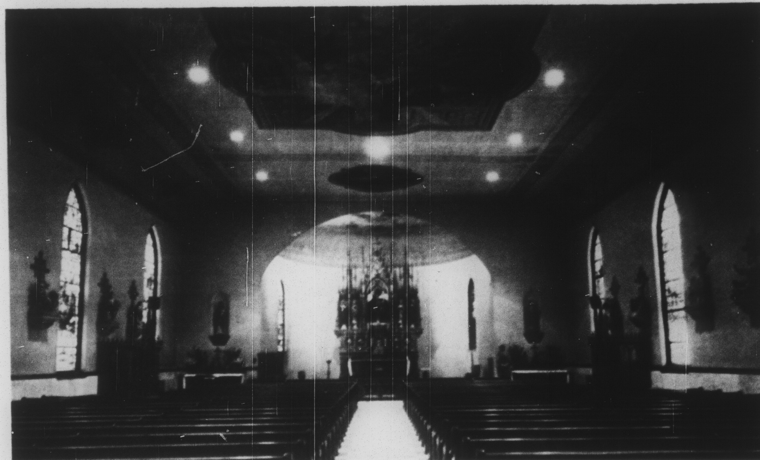
INTERIOR VIEW AT ST. BENEDICT'S CHURCH — TODAY

The Catholic Heritage handed down through the century is still evident in the Catholic community of Carrolltown. Customs of religious devotion are found in the town today that one would expect to find in Europe in the Middle Ages. Chief among these