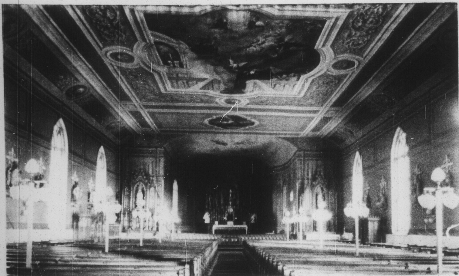
INTERIOR VIEW OF ST. BENEDICT'S CHURCH — BEFORE REMODELING