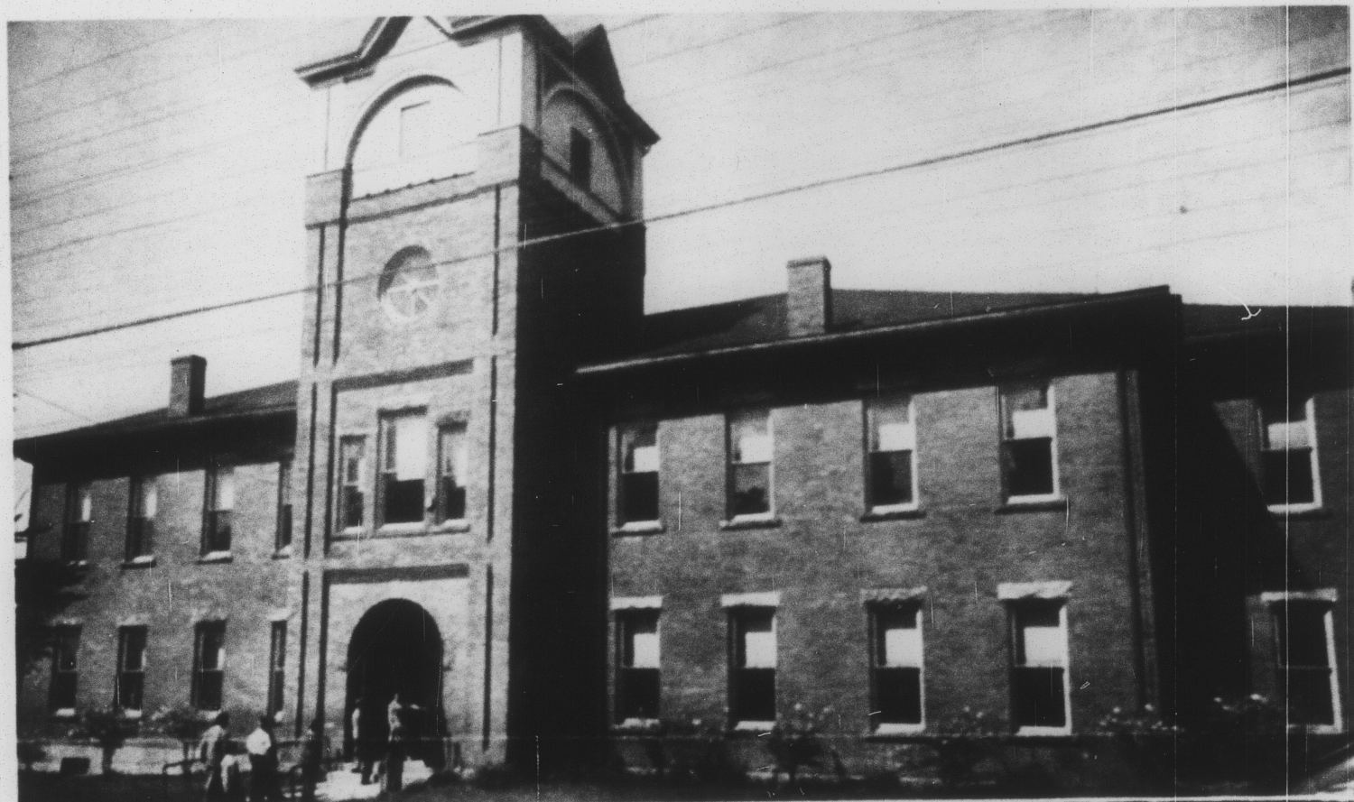
ST. BENEDICT'S PAROCHIAL SCHOOL

The church today has a new appearance. A modern and up-to-date church and school are the boast of the parish. This is a tribute to the priests and parishioners through the century. It signifies the zeal, the cooperation and the sacrifices of the early Benedictine Fathers, their succeeding conferees and the faithful parishioners, past and present.