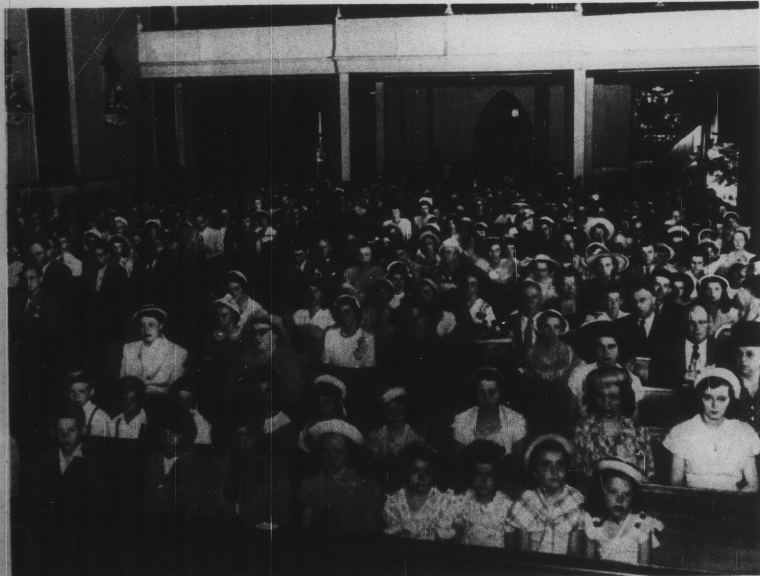
THE PRIEST'S VIEW FROM THE ALTAR