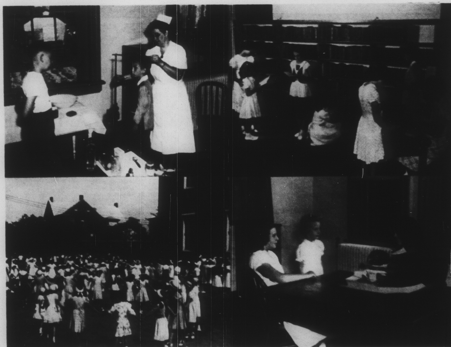
SCENES AT ST. BENEDICT'S SCHOOL