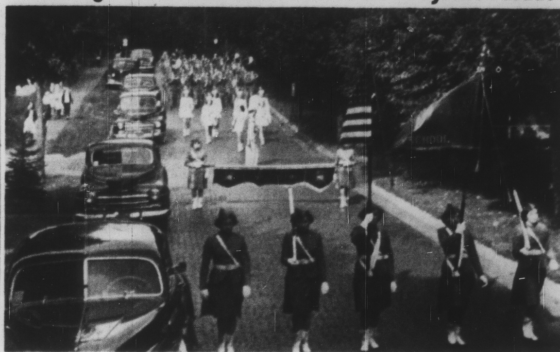
As a conclusion to its summer season, the Patton High School Band district firemen's parade at Tyrone. Among the organizations' other participation in Tyrone, the All-Star football game in Windber, and participation in contests at Pittsburgh and Barnesboro.