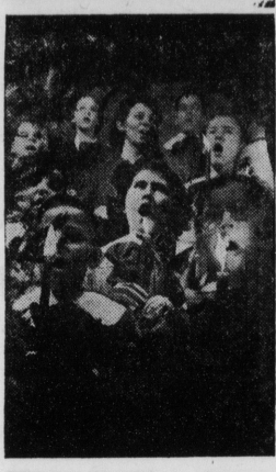
HERALD ANGELS... Rehearsing for the annual Christmas candlelight service, the children choristers of the Crawford Methodist Memorial Church in the Bronx, New York, make an impressive picture when viewed through a Christmas wreath in the foreground.