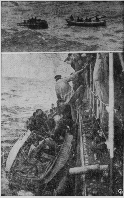
HERE ARE TWO dramatic photos showing the actual rescue of 18 survivors of the B-29 bomber that crashed 365 miles northeast of Bermuda. At top, the men's three-day ordeal ends as a whaleboat from the Canadian destroyer Haida approaches them. At bottom, the survivors come alongside the warship. Two of the crew were lost.