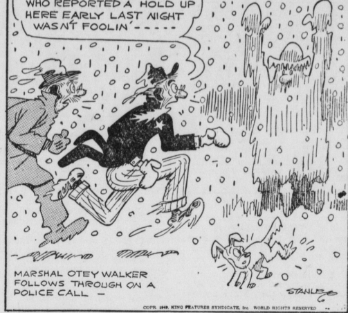
MARSHAL OTEY WALKER FOLLOWS THROUGH ON A POLICE CALL.