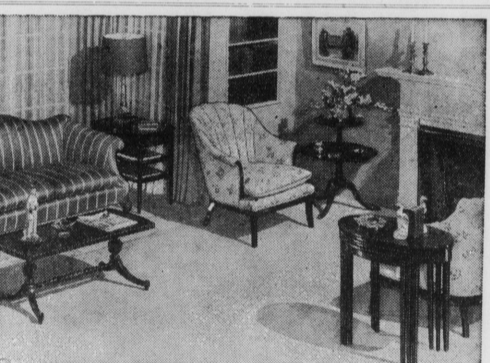
Tables add that "extra-special" touch to a room. As shown above, the proper placement of small tables fill out the empty spaces and give the room an air of gracious hospitality.