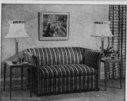
There's more to this small upholstered love seat than meets the eye. In one quick and easy operation, it opens into a comfortable bed. This and other styles in dual purpose sleep equipment are adequately solving many a sleeping problem during the continued housing shortage.