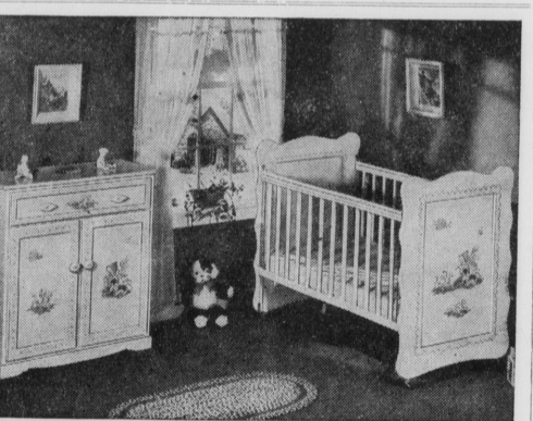
Juvenile furniture—gay, colorful, and practical—has been designed to make baby's life just as happy and pleasant and comfortable as possible.