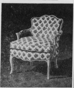
French provincial chair—this style is constantly winning new friends.

That the junior dining room sets are taking the place of the regular dining room suites in the small homes was revealed in a survey made last summer among manufacturers.