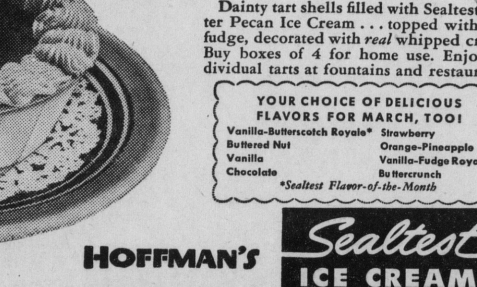
At The Sealtest Village Store, starring JACK CARSON—guest, JIMMY STEWART, Thursday, 9:30 P. M., WFGB