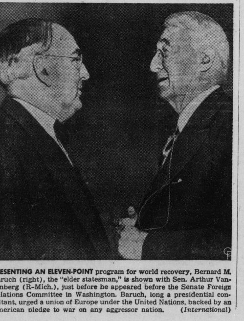
PRESENTING AN ELEVEN-POINT program for world recovery, Bernard M. Baruch (right), the "elder statesman," is shown with Sen. Arthur Vandenberg (R-Mich.), just before he appeared before the Senate Foreign Relations Committee in Washington. Baruch, long a presidential consultant, urged a union of Europe under the United Nations, backed by an American pledge to war on any aggressor nation.