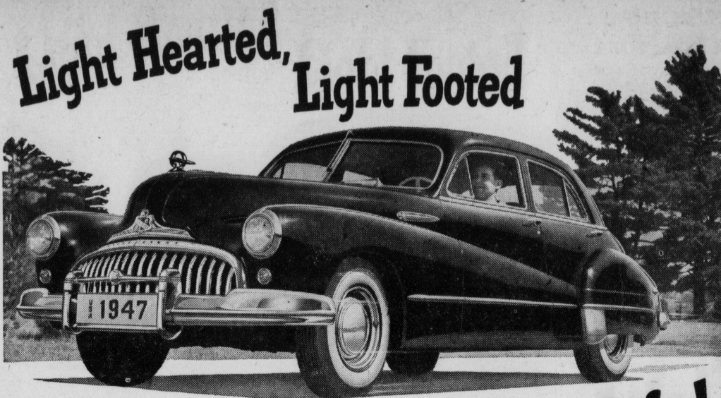
White allwood trim, as illustrated, will be supplied at extra cost as soon as available.

It is better to serve than to be served.