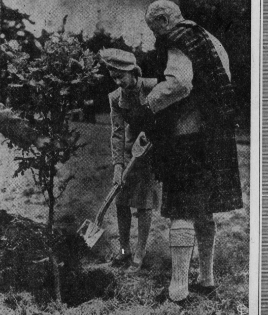
PRINCESS MARGARET is shown planting a tree on the grounds of Brodick Castle on the Isle of Arran, as the Duke of Montrose looks on. The young princess visited the small island, off the west coast of Scotland, as the guest of the Duke and the Duchess of Montrose.