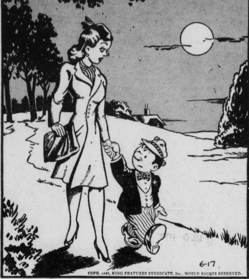
"Yes, Buck, it's romantic, holding hands in the moonlight—besides, I wouldn't want you to get lost!"