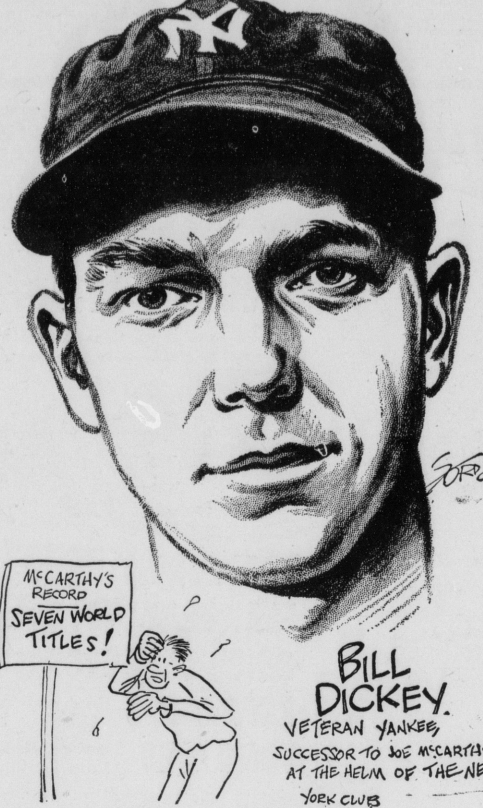
BILL DICKEY. VETERAN YANKEE. SUCCESSOR TO JOE MCCARTHY AT THE HELM OF THE NEW YORK CUBS