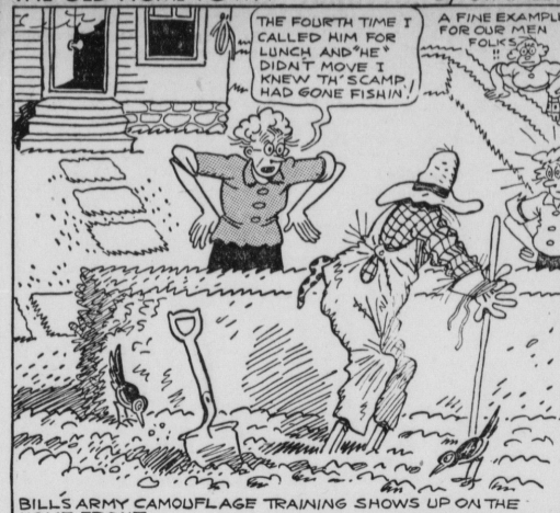
BILL'S ARMY CAMOUFLAGE TRAINING SHOWS UP ON THE HOME FRONT