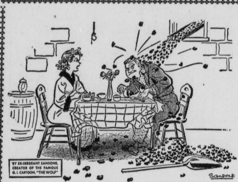
"I WISH YOU'D STOP COMPLAINING! WE'RE LUCKY TO HAVE A YEAR'S LEASE ON THIS PLACE!"

WHEN YOU BUY A HOME, be sure you are on safe and sound ground. Why not profit by our long experience in the home mortgage field. Our help and advice are yours for the asking, and if you want to borrow we'll welcome your application for a loan.