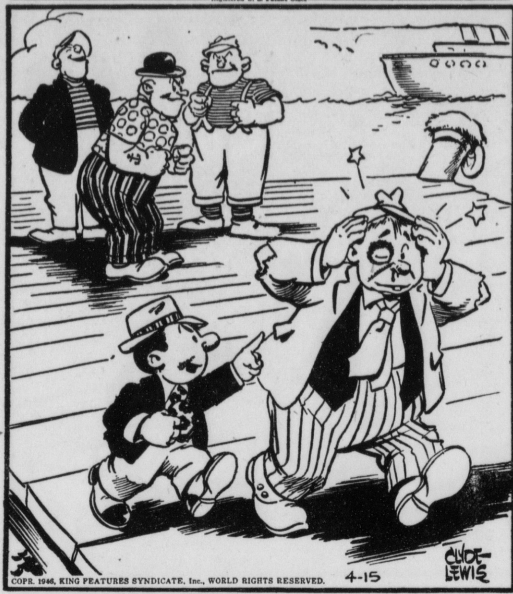
"You should take a lesson from the whale, Pal... he seldom gets in trouble until he starts spouting off!"