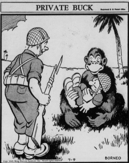
"Don't worry, Buck. It's just primitive, parental instinct!"

COMMERCIAL INSURANCE AGENCY GENERAL INSURANCE Liability Casualty 1101 Philadelphia Avenue Phone 467, BARNESBORO, PA.