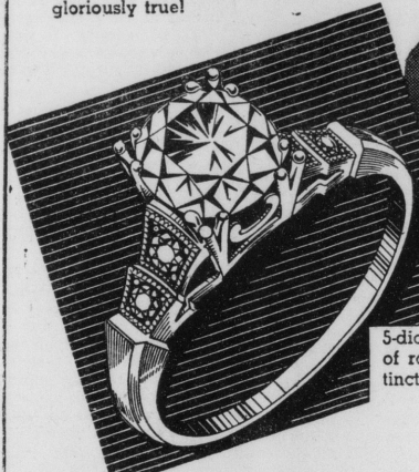
5-diamond Engagement Ring of rare beauty and true distinction. $110.00