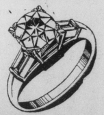
Brilliant diamond solitaire. Smart. Distinctive. Special value. $75.00