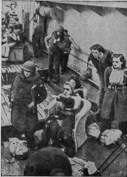
THIS DRAMATIC PHOTO was taken aboard a U. S. transport at the very moment the ship was being attacked by a U-boat. A Red Cross girl points to the spot where a U-boat was sighted. Note the tenseness of the others on the deck. The sub was either sunk or driven off before it had a chance to do any damage.