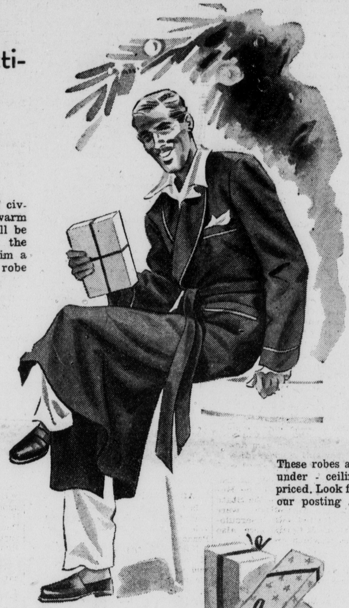
These robes are under-ceiling priced. Look for our posting . . .

It's all in the line of civilian duty to keep warm this winter. You will be doing your share in the effort by giving him a handsome tailored robe for Christmas.