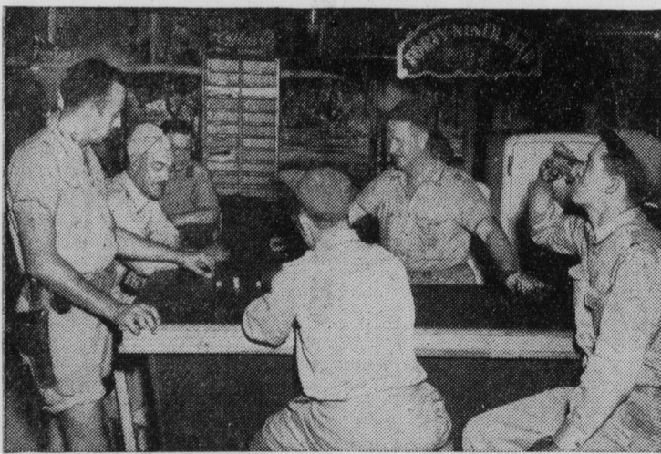
In the jungle near Darwin, Australia, is the Forty-Niner bar, gathering place for U. S. airmen, as shown in this picture just received in the United States. Only soft drinks are served at this bar.

ed Governor at Harrisburg in January—at least they won't be the most deserving of that honor.